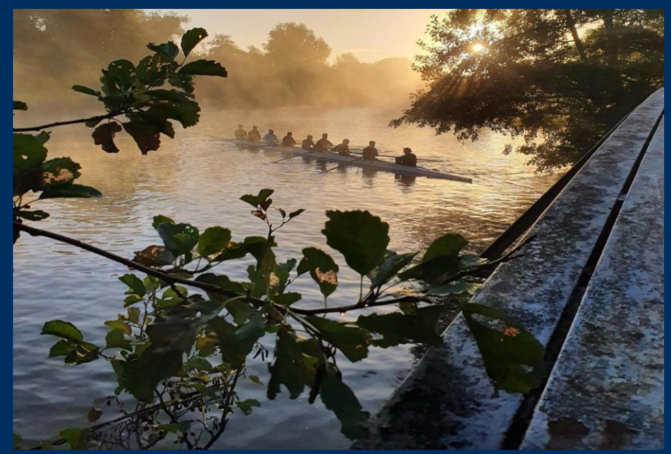
Early morning outings are being filled on both, Godstow and Isis, every day, Monday to Friday.

It is my great pleasure to introduce myself as President of this year's SHBC committee. Having worked my way up from complete novice when I joined the club to President three years later, I have seen SHBC go through a whole host of difficult circumstances and can safely say that we have come out the other side ready for some really great racing in the coming years. This year's committee in particular show an incredible commitment to novice recruitment and to organising high-quality training at all levels in the club, having already fostered an exciting atmosphere amongst our seventy-odd novices who have been trying out rowing and coxing for the first time in the last few weeks.