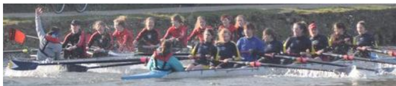
W1 Bumping Somerville in Torpids 2011

The senior women of SHBC saw many highs and lows in the 2011-2012 season. While W1 was thrilled to go up a place in division two in Torpids, the loss of senior rowers due to finals had a big impact on the crew's performance during Summer VIII's.