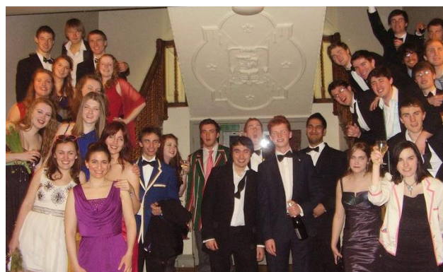
SHBC after Torpids Roast 2011

Looking forward from a very successful Michealmas term in all respects, we are anticipating a successful Torpids campaign for both the men and women - our ultimate goal to get everyone into those all important fixed divisions! It means a lot to have our current alumni spectators cheering us on at the boathouse, and we hope to see as many of you as possible down at the river very soon.