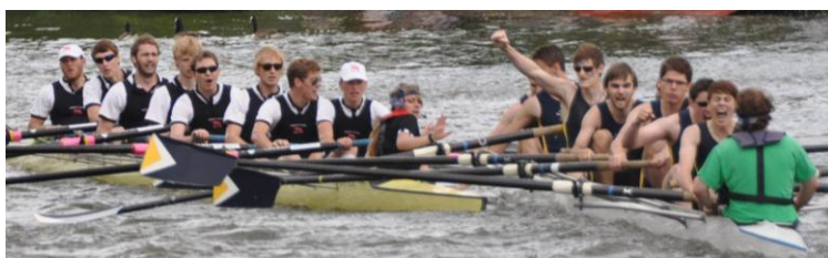
M1 winning blades in Summer VIII's 2011