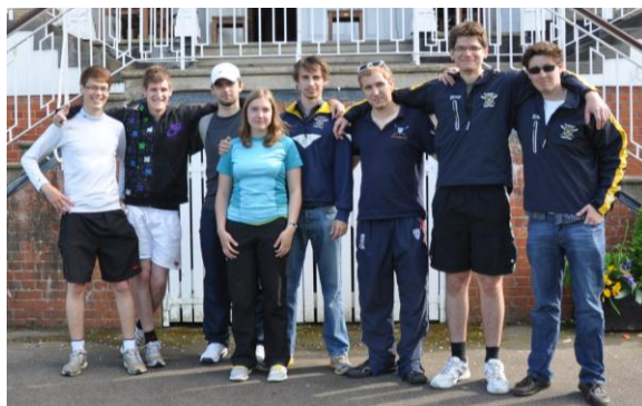
M1 at Leander Club training for Summer VIII's 2011

We are also looking to enter a third eight, who may have the chance to earn St. Hugh's a third spot in the fixed divisions in Torpids. This, together with the fact that we have managed to recruit enough rowers to have regular outings with a 4 th crew, shows that St. Hughs' Boat Club has become a rowing club to watch, with the men's side winning two set's of blades last year, and plenty more to show this campaign.