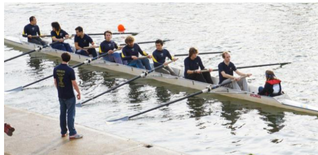
Men's Novice's on the Isis in Christ Church Regatta 2011

In Michaelmas 2011, we succeeded at recruiting three crews of committed novice rowers to defend the honour of St. Hugh's Boat Club at Christ Church Regatta. The outings were run by members of the first and second eight, who enjoyed the luxury of not being at the receiving end of technical advice for once (when you're standing on the bank, no-one knows that your posture is not flawless either...)