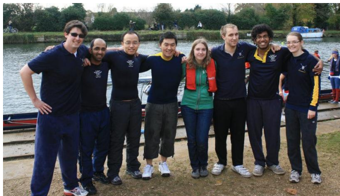
'The Centaur' crew after Christ Church Regatta 2011

Technical improvement was rather quick from the beginning, and some high-flyers even had the chance to join the second senior crew for a few outings. With our most successful crew in ChCh Regatta reaching the third round, we were happy to welcome many promising talents into the senior squad this term. A few faces are definitely worth watching with next term's first eight in mind!