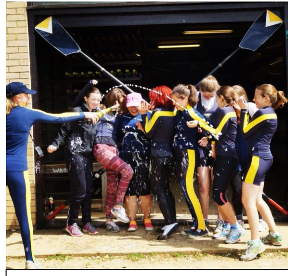
W2 celebrate winning blades in Summer Eights