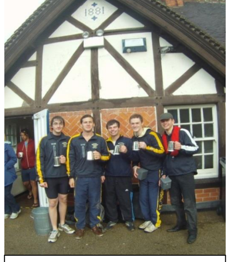
The Men's Novice Four after their win at Shrewsbury Regatta

I guess this is the last thing I'll be writing for SHBC. Thank you all so much for your amazing support over the course of the year, I was overwhelmed with the turnout at VIII's dinner, showing huge support. Lots to celebrate from this campaign, especially a set of Blades for W2 (I got to award blades, yay!!) who absolutely beasted their campaign, getting quite a few bumps before the gut! Whilst M2 and M3 might not have felt their campaigns went to plan (though M2 won the coveted 'rolling pins' award for rowing over in the same position every day), if you consider that when I first got here M3 didn't exist and M2 were foot of the river, to be where they are now (M2 Mid Div VI, M3 near top of Div VII) is fantastic. If we can keep the momentum going and still put out crews next year, soon enough we'll be looking at having our lower boats in fixed divs! M1 and W1 had it tough, with an 'epic' Corpus M1 behind M1, and W1 facing 'on for blades' Trinity (although denied by Mansfield). They did us proud, keeping their heads held high and are already raring to go for next year!