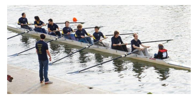
Men's Novice's on the Isis in Christ Church Regatta 2011

It's been great to see so much Alumni support at Torpids and Summer VIII's. Again we invite you to join us at Christ Church Regatta, with a bit more of a light hearted feel as we watch some of our new generation of rowers compete for their first time.