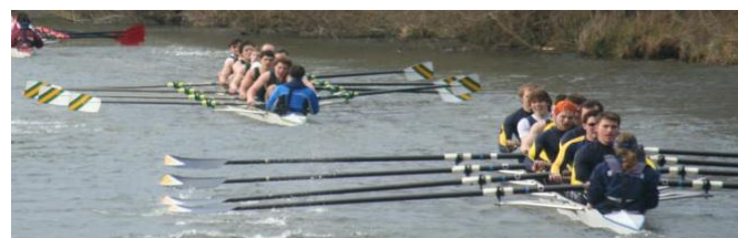
M1 gunning down St Peters 1 st VIII

Last term we announced we were determined to bump our way into Division II. This time, we can, not without pride, announce that we have! We are especially grateful for this reward of our training efforts, as events were initially not playing into our hands. We very narrowly missed a bump on Keble on the first day, as the race was cut very short by an incident elsewhere (I believe the cox of St. Antony's steered into the bank – perhaps by some misplaced ambition to row overland – thus propelling one of their rowers out of the boat). To add to the frustration, Keble were lucky enough to escape us when University College crashed in front of them. The second day of racing we were chased again by Merton. Having seen the results of the first day, they adapted their strategy and decided they needed to bump us quickly. The 'fly and die' strategy offered the delightful spectacle to our supporters in the gut of an impressive 'fly', getting to within a quarter boat-length of our M1, and an even more remarkable 'die' as the gap lengthened until they were bumped by Somerville.