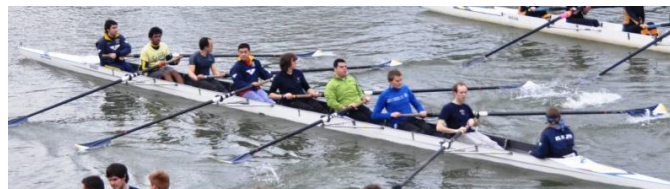
M3 at Rowing On

The third eight demonstrated themselves to be a very powerful crew, setting the fastest ever time during rowing on for a St Hugh's M3. Unfortunately despite this, they missed out on qualification by only seven seconds. Over the term they developed from novices to a coherent and impressive crew who have plenty of potential to perform in VIII's.