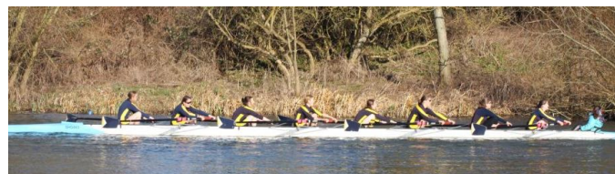
W1 at Torpids 2012