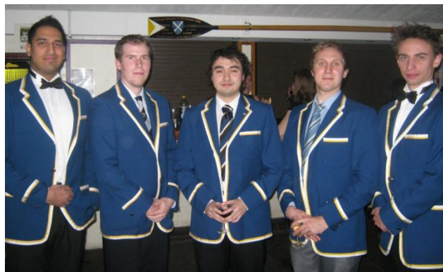
Torpids Roast 2012 with some notable alumni

Looking forward from a very successful Torpids, with M1 & M2 ranking the highest they have ever been, and the women putting out two boats out this year; we are anticipating a very successful Summer VIII's campaign for both the men and women. It means a lot to have our current alumni spectators cheering us on at the boathouse, so thank you all the alumni who made it to Alumni Drinks (in spite of the sudden blizzard) and Torpids. It was great to see your support and we hope we can count on it again this summer