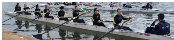
W2 at Rowing On