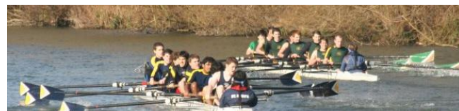
M2 gunning down St Peters 2 nd VIII

M2 have again had a highly successful term. Taking a mixture of last year's second 8 and novices from this year they were a force to be reckoned with, posting a very fast time at IWL. This continued into Torpids, where